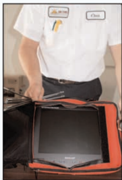
Roto-Vision® video inspection system