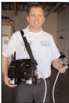
Antimicrobial Disinfectant Fogging